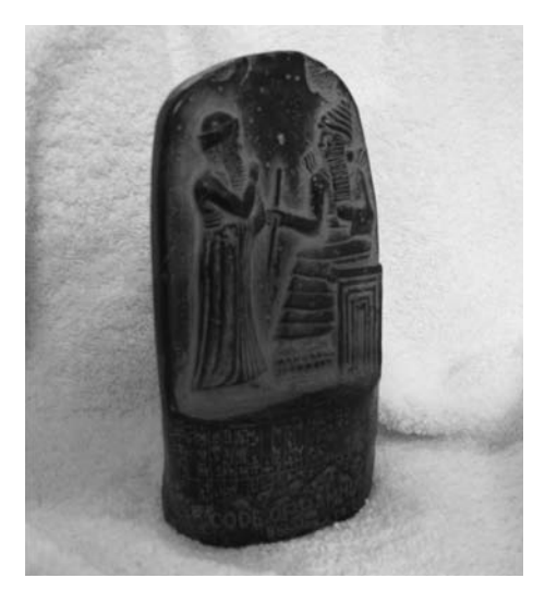
EXHIBIT 1.1 Code of Hammurabi Stele (top portion)

The code is known for its "eye for an eye, tooth for a tooth" philosophy ( lex talionis is a Latin phrase meaning "the law of retaliation"). Adultery and theft were punishable by death. A slave who disobeyed his master lost an ear, which was an ancient symbol of obedience. If a surgeon caused injury, his hand was cut off; this provision may have been the first version of malpractice law known to humankind. In addition to these harsh standards, the code contained